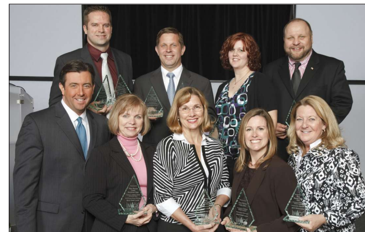
Time Warner Cable Winners