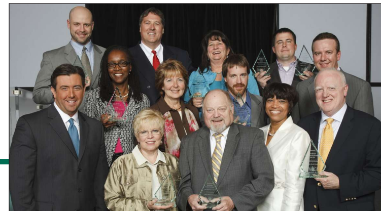
Buckeye CableSystem Celebrants