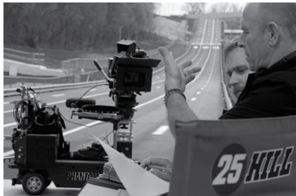
Akron served as the setting for 25 Hill, a movie filmed against the backdrop of the All American Soap Box Derby.

"We have $10 million available in tax credits for 2012 and $12 million available for 2013. All of the 2012 funds are spoken for." Sabatino added that as the Ohio Film Office gets more attention on a national basis, the competition only grows.